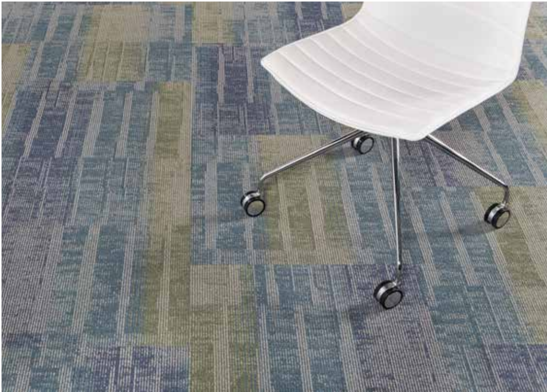
(top left) Well Versed Tolkein . (bottom left) Well Versed Hughes . (below) Well Versed Herrera .