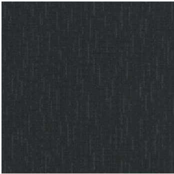
Tone Modular 7024 Modular 1756 Prelude