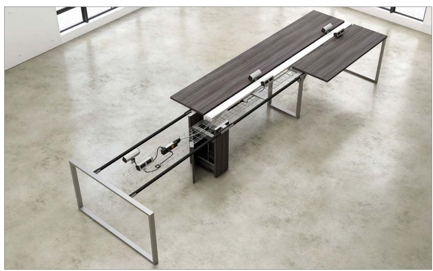
Steel beams running between the support legs give lateral strength to the bench while supporting the worksurfaces. Steel or laminate intermediate legs can be used to provide support for longer runs. The 8-wire, 4-circuit electrical can be placed in the wire basket under the worksurfaces.

Synapse offers multiple solutions for bringing power and data to workstations