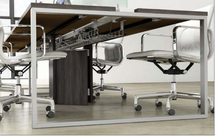
The wire basket can be easily disconnected in order to place power cords, power bricks, or other peripherals.