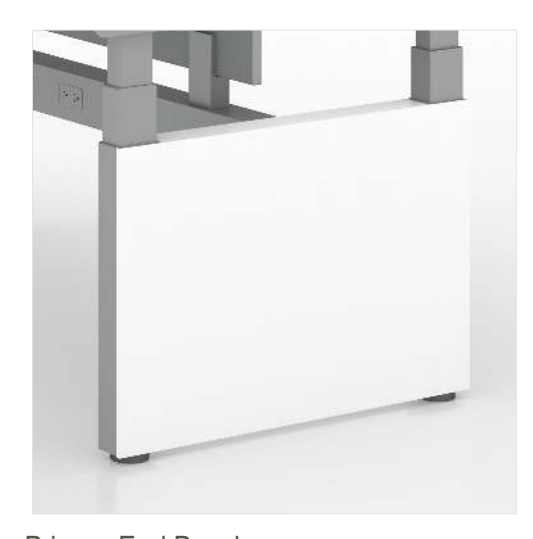
Privacy End Panels