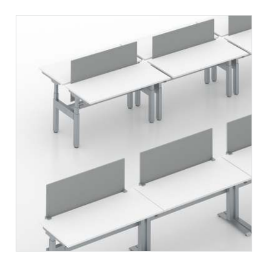
Single and Double Runs