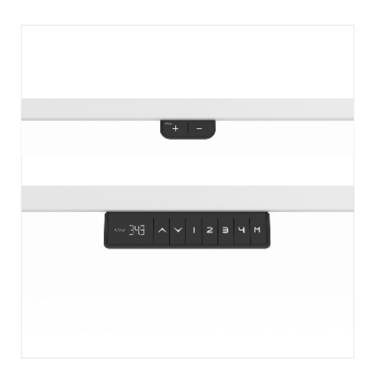
Standard up/down controls or upgrade option with 4 memory presets

See our price book/spec guide for all sizes, options and accessories