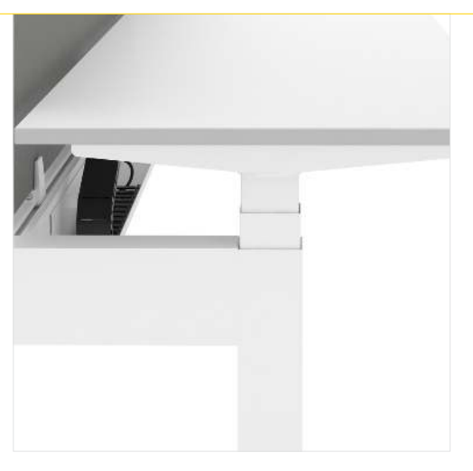
1-stage, 2-stage and 3-stage legs with anti-collision functionality